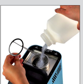
Calibration bath tub P/N IOPTC-BT-1