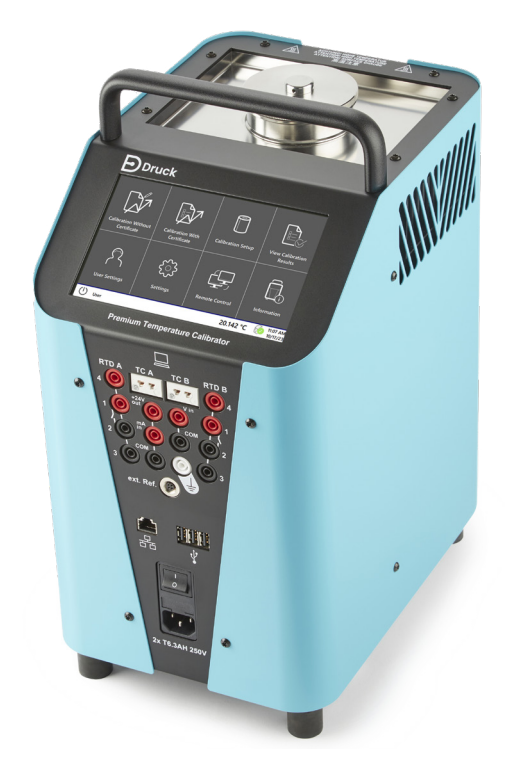
PTC165i Integrated measuring model